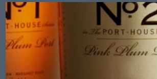
THE PORT HOUSE SERIES