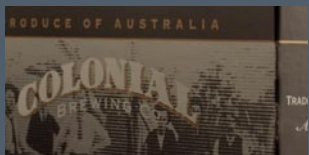
COLONIAL BREWING CO.

The New Mountain Sandalwood brandmark, which reflects the gathered sandalwood sticks piled on the desert floor, is also reminiscent of a mountain formation. The revised packaging series shares a strong colour palette, communicating clearly while generating a powerful shelf presence that will increase sales.