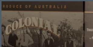
COLONIAL BREWING CO.