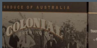
COLONIAL BREWING CO.