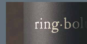
YALUMBA - RINGBOLT