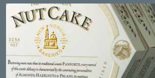
NEW NORCIA - NUTCAKE