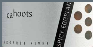
BERRY FARM - CAHOOTS

From the outset this has aided the distribution of the wines, sold in restaurants and fine liquor outlets Australia wide, and the products have been picked up by a national distributor.