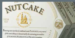
NEW NORCIA - NUTCAKE