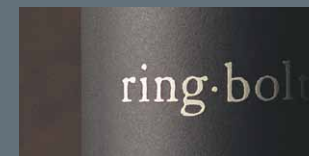
YALUMBA - RINGBOLT