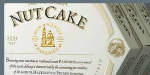
NEW NORCIA - NUTCAKE