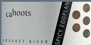
BERRY FARM - CAHOOTS

The story builds upon the positioning statement and gives the brand depth. This assists with product perception and retention, particularly in the above-the-line marketing material – developed specifically to introduce the Ringbolt brand to export markets.