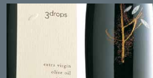
3 DROPS - WINES & EXTRA VIRGIN OLIVE OIL