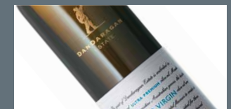
DANDARAGAN ESTATE - EXTRA VIRGIN OLIVE OILS