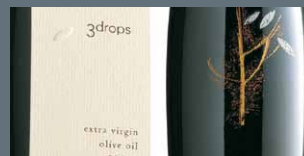
3 DROPS - WINES & EXTRA VIRGIN OLIVE OIL