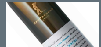
DANDARAGAN ESTATE - EXTRA VIRGIN OLIVE OILS